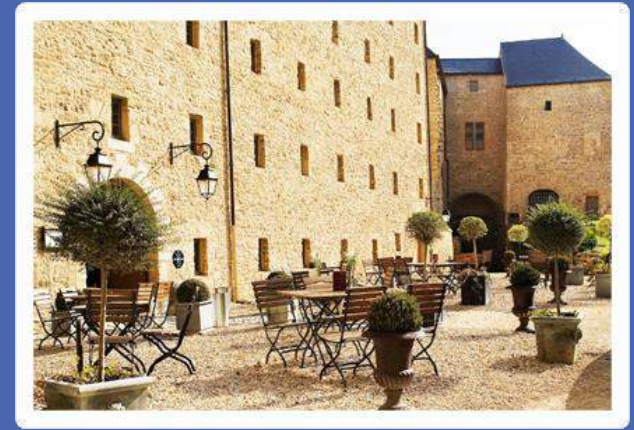
Chateaux Fort Sedan – Night 2

“With its incredible hospitality Abbaye d'Alspach is one of the finest boutique hotels in Haut-rhin.”