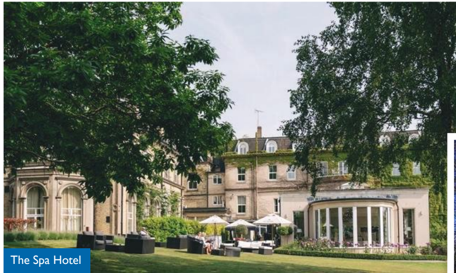
The Spa Hotel

Two nights at The Spa Hotel will give you the opportunity to visit the Georgian colonnade of shops, known as The Pantilles, a 10-minute walk from our hotel.