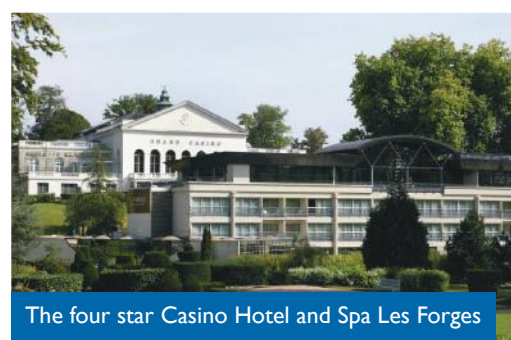
The four star Casino Hotel and Spa Les Forges