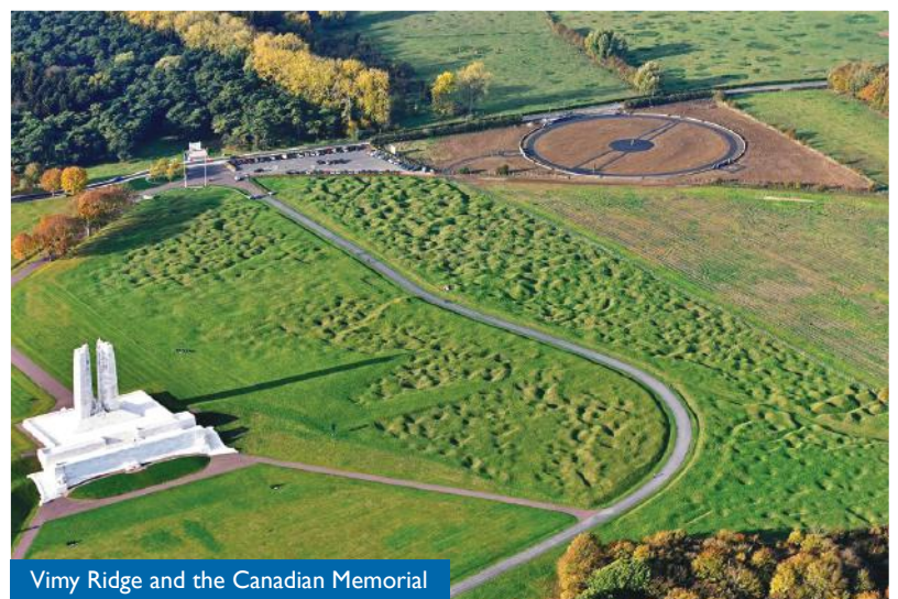
Vimy Ridge and the Canadian Memorial

The Autumn Amble is a relaxed Motoring Tour, based in one hotel for 4 nights, after an evening crossing to France and one night in Ouistreham and a drive across rural Normandy.