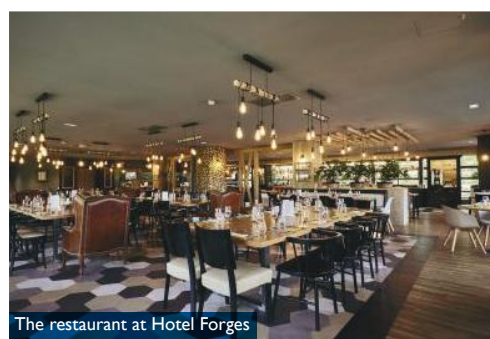
The restaurant at Hotel Forges