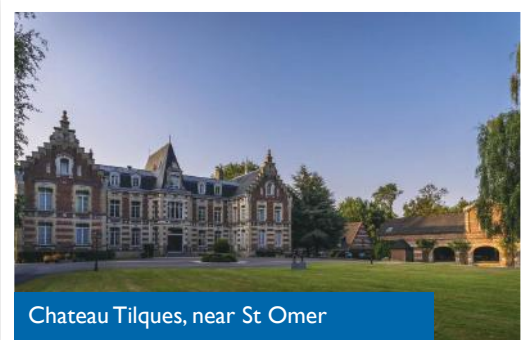
Chateau Tilques, near St Omer