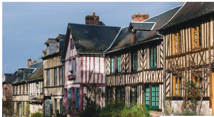
Le Bec Hellouin - Normandy architecture at its best