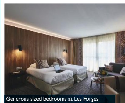
Generous sized bedrooms at Les Forges