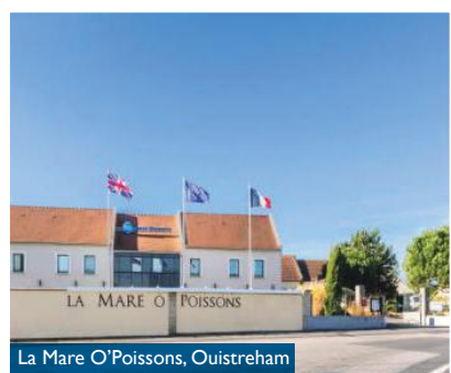
La Mare O'Poissons, Ouistreham