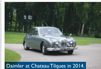
Daimler at Chateau Tilques in 2014.

Our Prices for the six night Half Board Tour From £1385.00 per person sharing accommodation and car